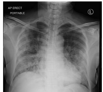
FIGURE 1 Chest radiograph in COVID-19

An erect plain radiograph of the chest in a nonpregnant woman from Singapore with laboratory confirmed COVID-19 demonstrates bilateral and peripherally distributed air-space opacities.